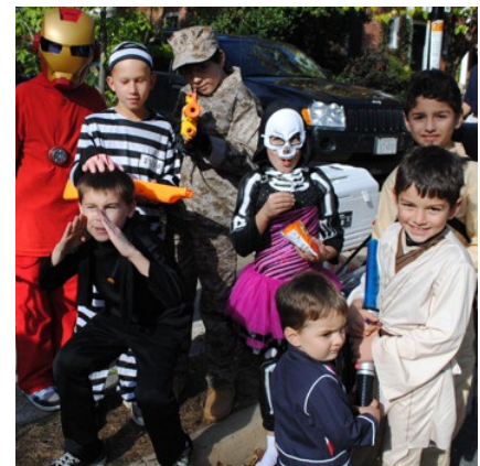
2010 Halloween Parade: more on pg.2

As development continues in S. Arlington, ARCA is working to establish a framework that consolidates our voices and provides our vision to the County by using the upcoming neighborhood survey, the Crystal City Citizen Review Council (CCCRC) and our involvement in the Long Range Planning Committee. We need your input and feedback to ensure that we are capturing your vision for the neighborhood. Help us by completing the survey, attending the meetings, and/or emailing us your thoughts at arcaneighbor@gmail.com . We look forward to seeing you on Nov 18th. Details on plans for Crystal City and Pentagon City: see pg.3