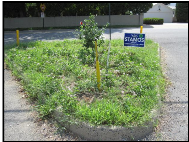
Same area August 2011

This area would receive the same treatment as the grassy area. We would keep the holly bush and the informal slate walkway which was purchased and installed by an ARCA neighbor. We would also keep the yellow site poles which have helped reduce the numbers of vehicles driving over the triangle.