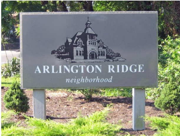
Sign installed by County NC Program