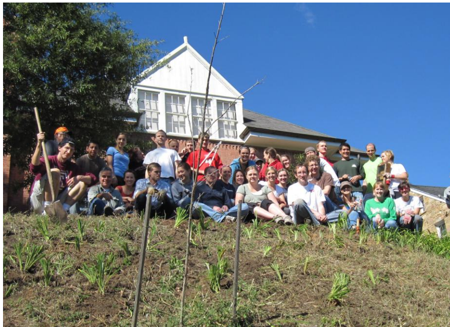
Friends of Hume School – Oct 2010