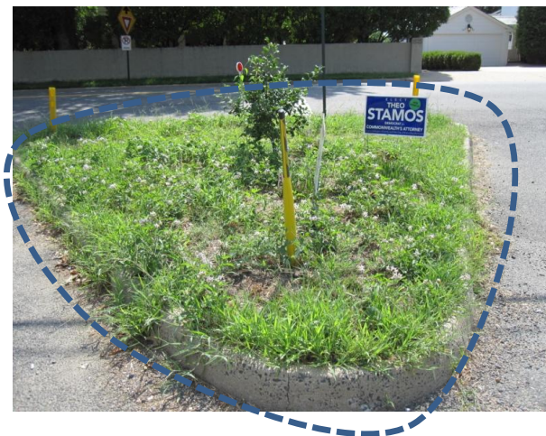
Approximately 215 Square Feet