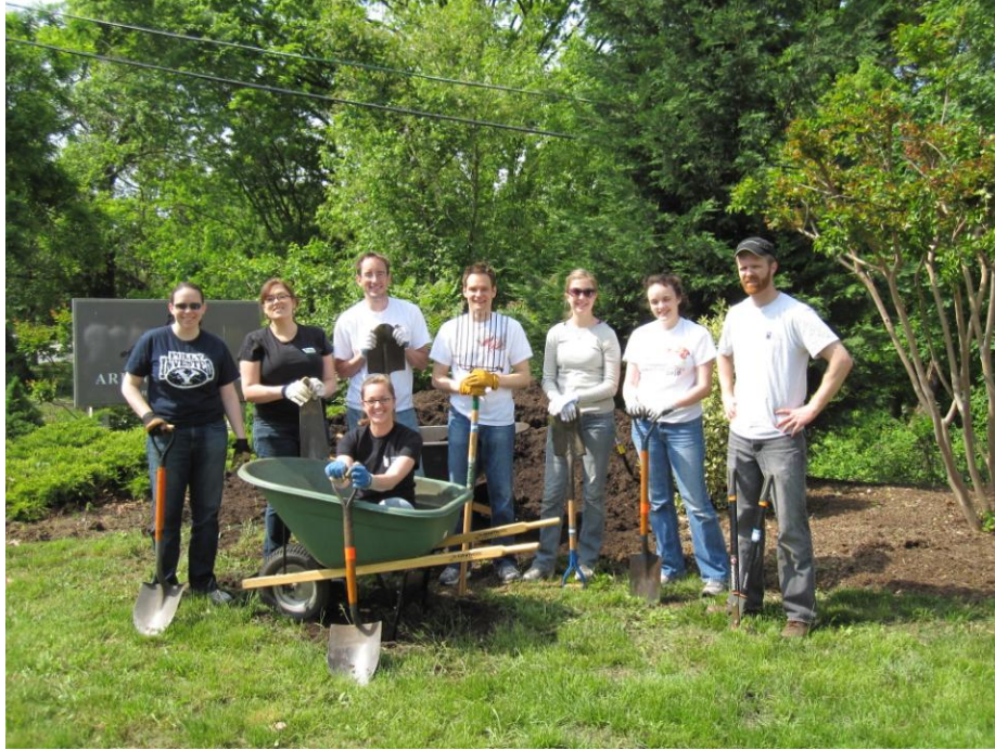
Volunteers at I395/Ridge May 2011

Friends of Hume School volunteers would continue to maintain these areas at their twice yearly volunteer days. Additionally, neighbors will do some periodic weeding between volunteer days.