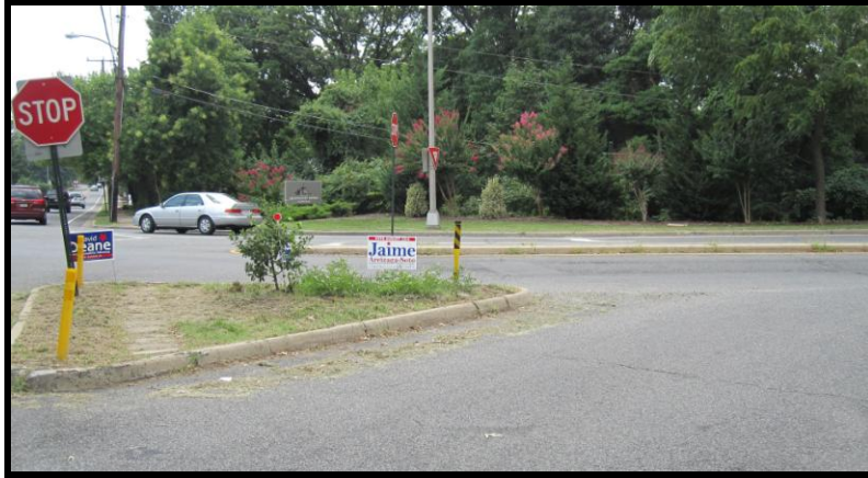
The traffic island is at the same intersection of I-395/Ridge Road