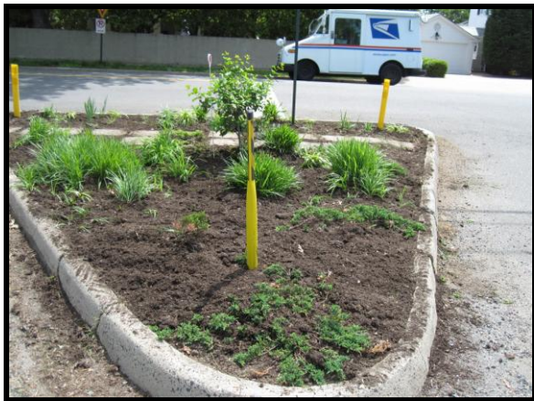
I395/Ridge and Traffic Island May 2011... after volunteers work their magic