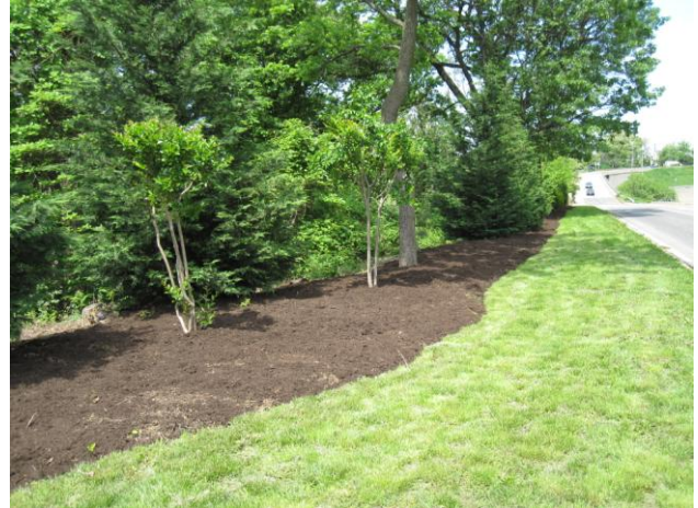
May 2011 – after volunteer day